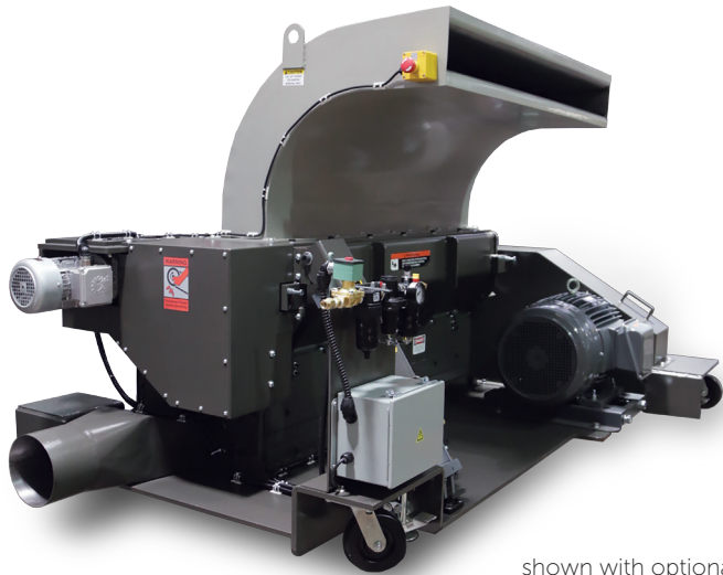
shown with optional infeed chute