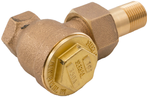
Thermostatic Trap (750-A)